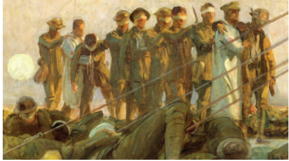
War injuries: The famous picture entitled 'Gassed' by John Singer Sargent completed in March 1919 demonstrates the appalling impact of eye injuries from mustard gas and illustrates what patients and staff had to cope with. Imperial War Museum, London.

Louis Werner Snr, one of the surgeons in the RVEEH also acted as a Consulting Surgeon in the Mater Hospital in Eccles Street. In 1917, the capacity of the Eye Wards in the Mater Hospital was increased to 24 beds now placed in adjoining wards to